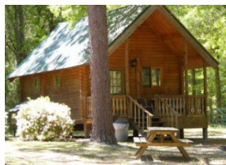
Suwannee River Rendezvous Resort and Campground - Mayo

For more information: SuwanneeRiverPaddleForAutism or 386/294-1025