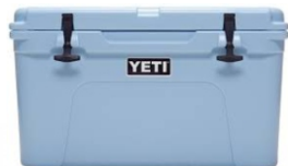
Bow To Stern Marine - Mayo